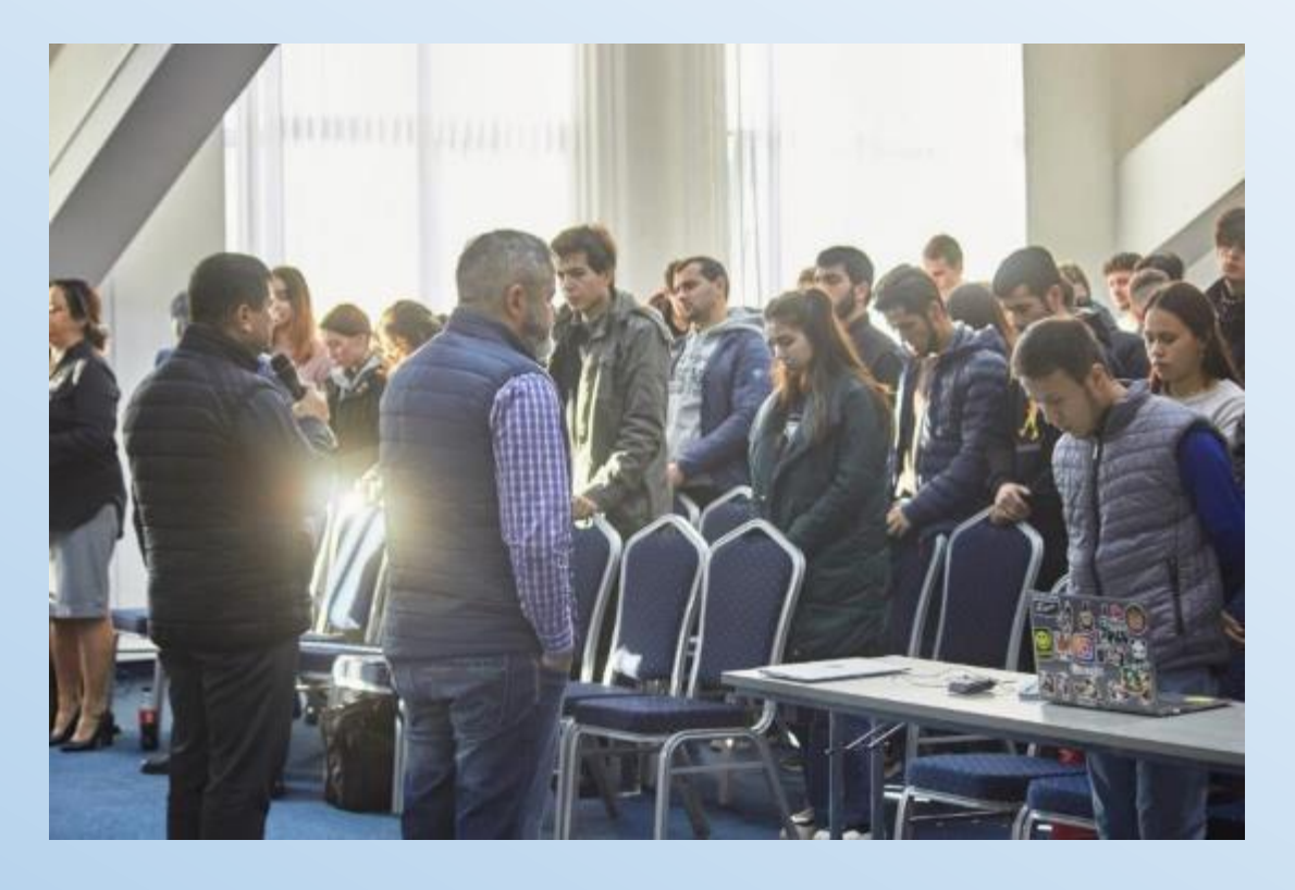
Trauma Counseling Conference