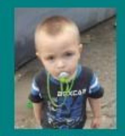
SERGIU I VEAR OLD