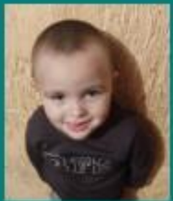
NIKU 2 YEARS OLD