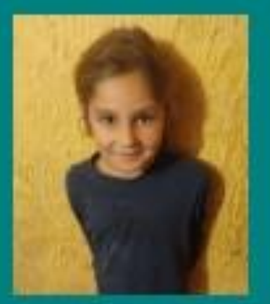
T YEARS OLD